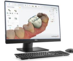
Studio App PC

Resolution: Full HD (1920 x 1080) Processor: Intel® Core™ i7 8 th Generation or AMD Ryzen™ 7 2700 or better Memory: 32 GB Disk: 1 TB SSD (or more) Graphics card: NVIDIA® GTX 1060 6 GB or better Operating system: Windows 10 Pro Optional: Touch screen 3DConnexion Space Mouse Pro