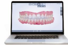
Studio App PC

Resolution: Full HD (1920 x 1080) with touch Processor: Intel® Core™ i7 8 th Generation / AMD Ryzen™ 7 3750H or better Memory: 32 GB Disk: 1 TB SSD Graphics card: NVIDIA® GTX 1050 4 GB or better Operating system: Windows 10 Pro